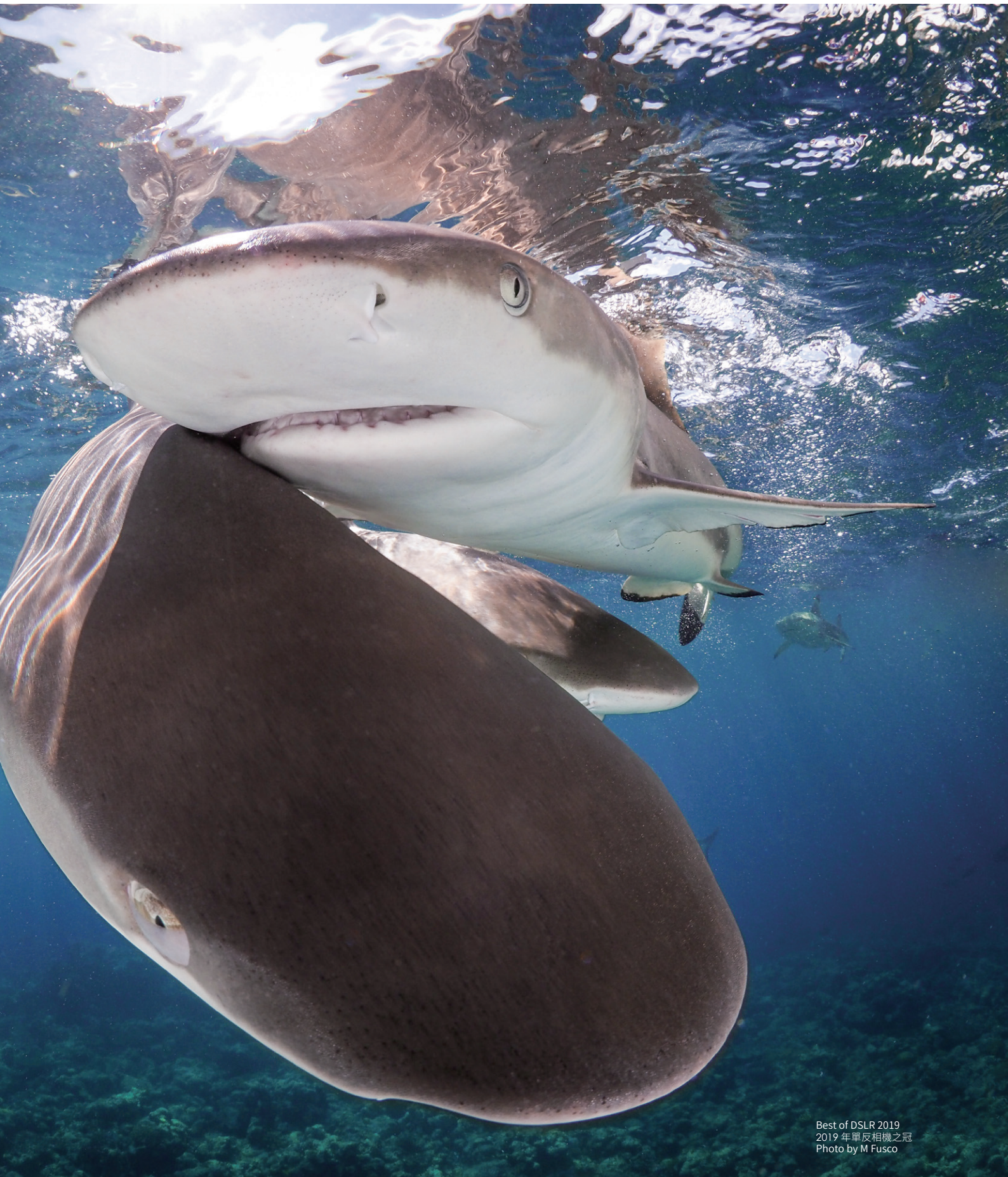
Best of DSLR 2019 2019 年单反相機之冠